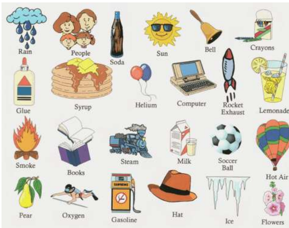
Matter around us

Ans: The following substances are matter: Chair, Air, Almonds, Lemon water, and the smell of perfume (The smell is caused by volatile substances which are matter, as they occupy space and have mass).